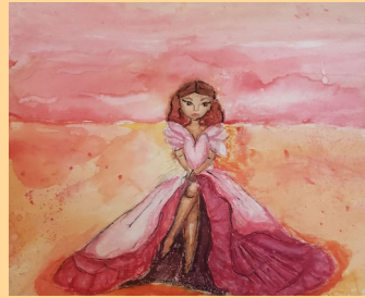
Color Schemes/Color Theory Assignment Lucas Loza, 9th grade