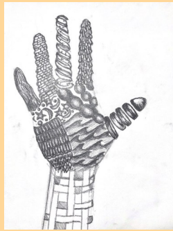
Texture Assignment Sophia Kang, 9th grade