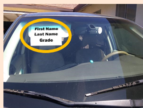
Tip: Flip down the visor with sign when you're in the line